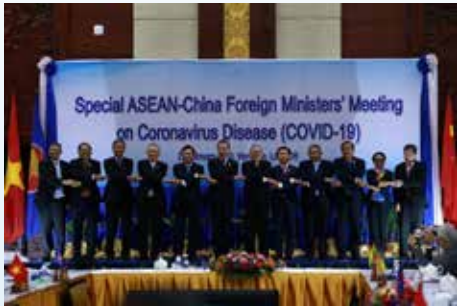
The Special ASEAN-China Foreign Ministers' Meeting on Coronavirus Disease is held in Vientiane, capital of Laos, Feb. 20, 2020.

They expressed full confidence in China's abilities to succeed in overcoming the epidemic and commended all frontline fighters against the disease, as China appreciated the sympathy support and assistance offered by ASEAN member states to its response efforts.